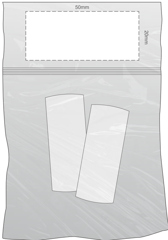
SIDE A (Front) Transparent label - CMYK Full colour

Simply send us the artwork and we will create a stunning design.